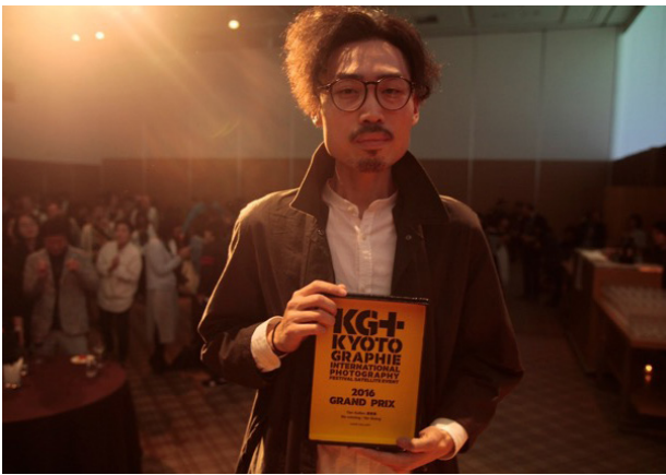
KG + AWARD Yan Kallen / KYOTOGRAPHIE 2016

On April 24th 2016, KYOTOGRAPHIE INTERNATIONAL PHOTOGRAPHY FESTIVAL and its satellite event KG+ proudly announced, in the ballroom of the Hyatt Regency Kyoto, the winner of the KG + AWARD by GRAND MARBLE as well as the reviewers choice selected from the KYOTOGRAPHIE International Portfolio Review, supported by HASSELBLAD