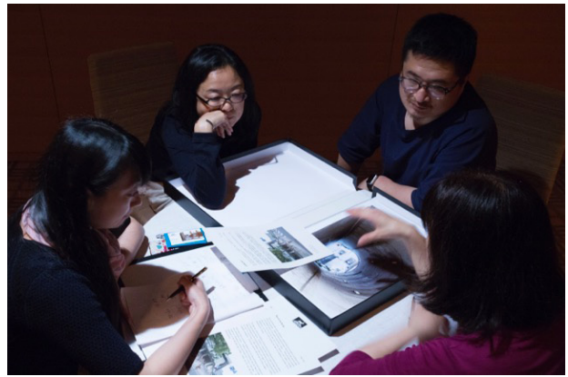
Portfolios Reviews / KYOTOGRAPHIE 2016