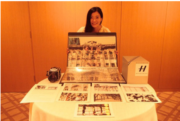
Yuna Yagi / KYOTOGRAPHIE 2016 © Naoyuki Ogino