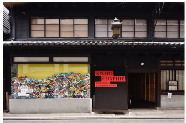
Chris Jordan & Jurgen Lehl | Kondaya Genbei Kurogura / KYOTOGRAPHIE 2016