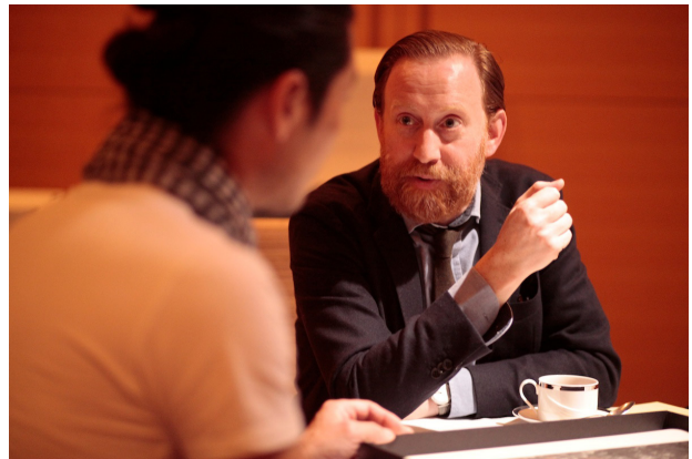
Simon Baker | Portfolios Reviews / KYOTOGRAPHIE 2016