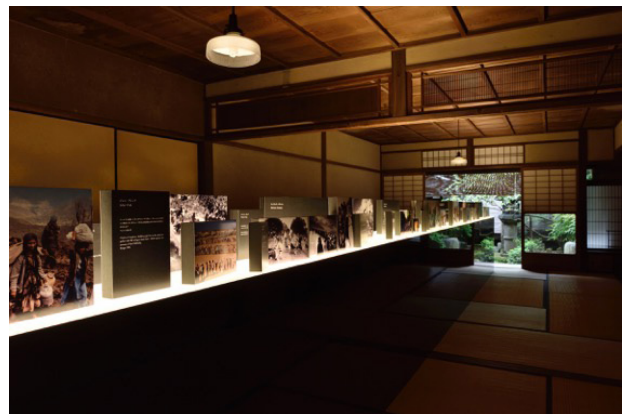
Magnum Photographers-Mumeisha / KYOTOGRAPHIE 2016 © Takuya Oshima