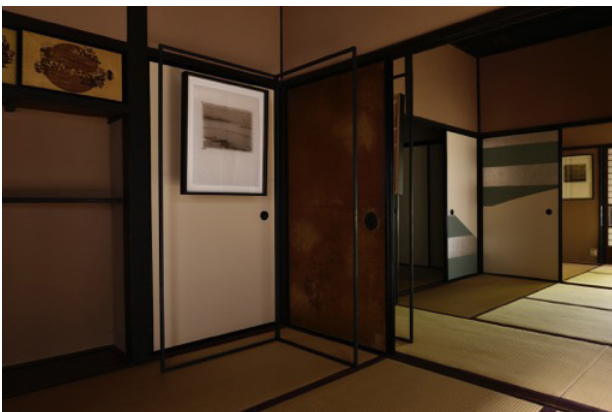
Sarah Moon | Shokian Mirei Shigemori / KYOTOGRAPHIE 2016