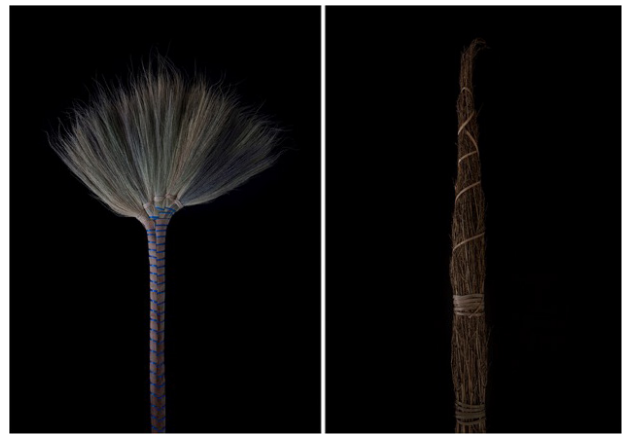
Rhythm of Nature 7 © Yan Kallen