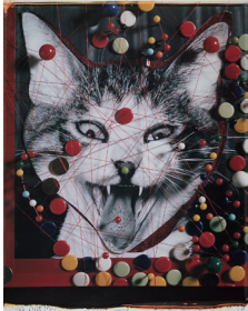
01 A GAME, 1991

*Additional programs announced in February 2018.