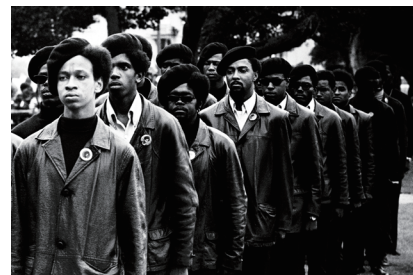
13 Panthers on Parade, Oakland, July 28th 1968