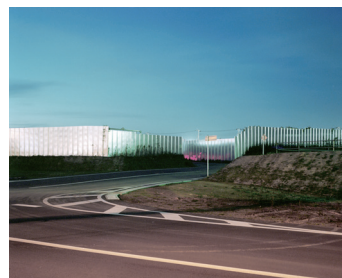
10 Tenjinmine, Narita, Chiba, 2017 © Tomomi Morita