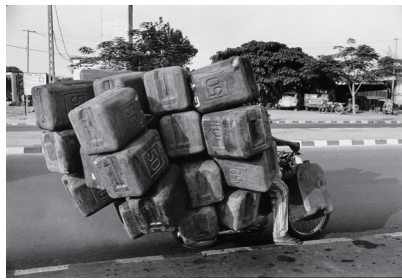
05 Pied a terre, 2004 © Romuald Hazoumè.