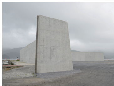
12 COASTAL MOTIFS, 2017-2018 (#9183, Ofunato, Iwate-prefecture)