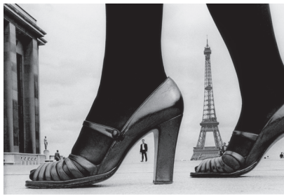
06 For "STERN", shoes and Eiffel Tower, 1974, Paris, France