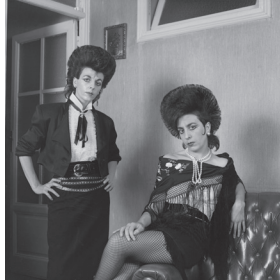
02 Dos Ladies, 1988 © Alberto García-Alix