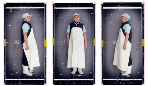
07 TAPE-O-GRAPHS from the HATARAKIMONO PROJECT, 2017 © K-NARF 2017