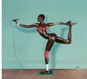
03 Grace revised and updated, painted photo, New York, 1978 © Jean-Paul Goude