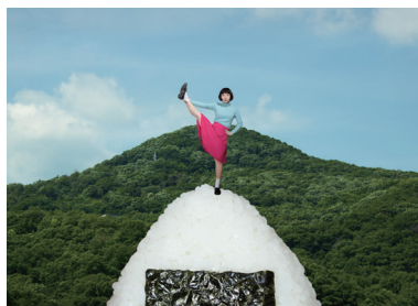
09 riceball mountain, 2016 © Izumi Miyazaki