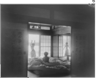
3 Guimet National Museum of Asian Arts Apollinaire Le Bas, Japanese Warrior, 1864 4 Fosco Maraini, The Enchantment of the Women of the Sea, Japan, 19545 5 John Coltrane "Blue Train" session of September 15th, 1957 6 RongRong & inri, Tsumari Story, 2014