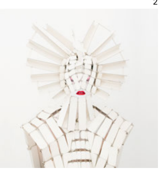
1 Marc Riboud, Alaska 1958 2 Kimiko Yoshida, Painting (Condottiere Micheletto Attendolo da Cotignola at the Battle of San Romano by Paolo Uccello). Self-portrait, 2010